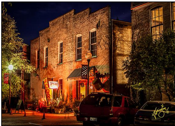
The Acorn Theatre, next to the Journeyman Distillery

Located in the heart of Harbor County in Southwest Michigan, this community is waiting for the right person to guide opportunities in residential development, medical development and infrastructure projects. The downtown is filled with shops, restaurants, a distillery, live theatres, and markets. The restaurants offer sidewalk/street seating in warm weather.