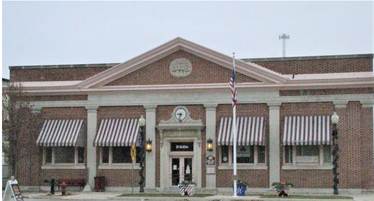
Three Oaks Village Hall

The ideal candidate will be someone early or late in their career who can demonstrate they have an inclusive management style. She or he may now be a manager or second-line administrator or a department level administrator looking to move up. While the right person may already be a municipal executive, we are aware of successful managers from related experiences in the private sector. Regardless, our top candidate will exhibit a strong customer service