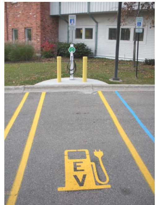
PHEV Dodge Ram Truck at Auburn Hills City Campus Charging Station